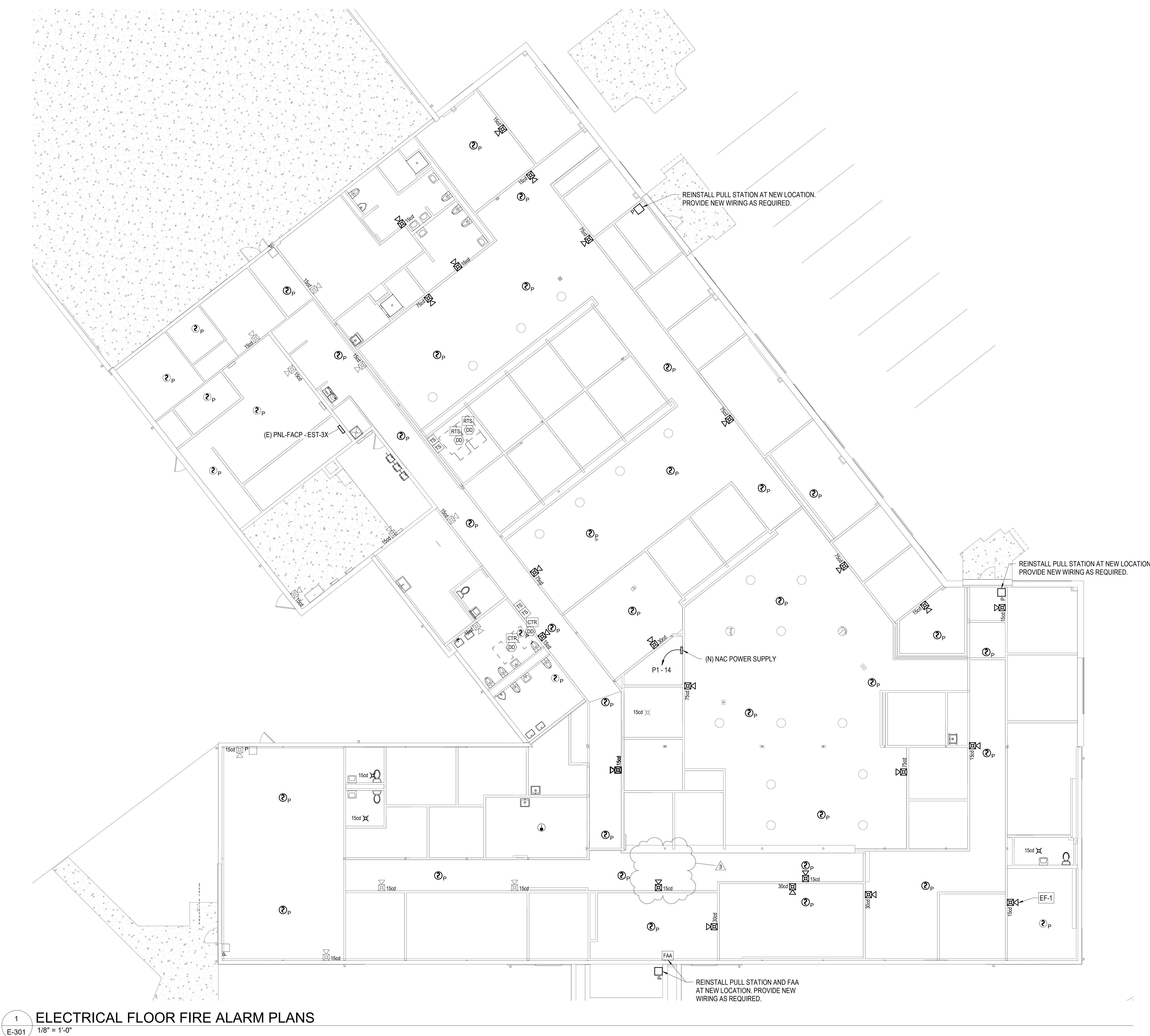
1 ELECTRICAL FLOOR FIRE ALARM PLANS E-301 1/8" = 1'-0"

THE RECEIVER OF THESE PLANS BY PROCEEDING WITH CONSTRUCTION, TRANSMISSION OR USE THEREOF, AGREES TO HOLD THE ARCHITECT HARMLESS FROM AND IN DEFENSE OF ALL REASONABLE CLAIMS AND DAMAGES THAT MAY BE ASSERTED AGAINST THE ARCHITECT BY ANY PARTY, INCLUDING THE CLIENT, ARISING FROM THE USE OF THESE PLANS. THE ARCHITECT'S LIABILITY IS LIMITED TO THE ARCHITECT'S NEGLIGENCE IN THE PERFORMANCE OF PROFESSIONAL SERVICES. THE ARCHITECT'S LIABILITY IS LIMITED TO THE ARCHITECT'S NEGLIGENCE IN THE PERFORMANCE OF PROFESSIONAL SERVICES. THE ARCHITECT'S LIABILITY IS LIMITED TO THE ARCHITECT'S NEGLIGENCE IN THE PERFORMANCE OF PROFESSIONAL SERVICES.